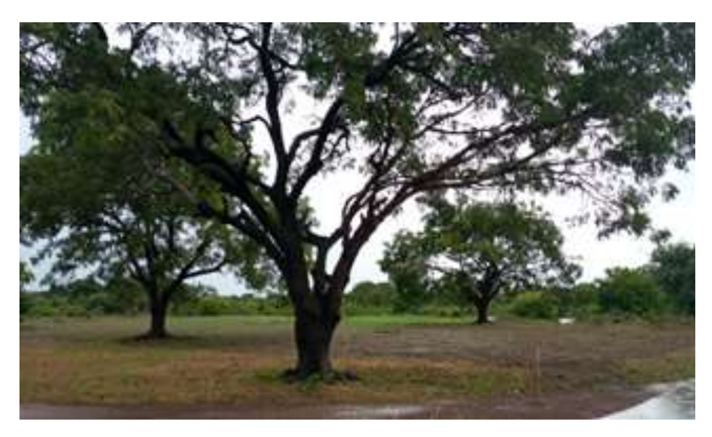
Figure 1. Néré plant ( Parkia biglobosa ).