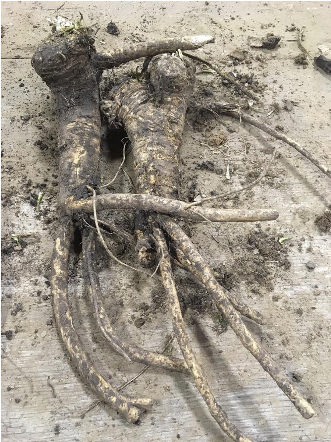
Figure 3. Horseradish cultivar 906, released in 2012 from the Illinois, USA breeding program. This cultivar resulted from a proven cross of 1573 (high primary root biomass, but highly susceptibility to internal root discoloration) \times 315 (high primary root biomass and high tolerance to internal root discoloration).