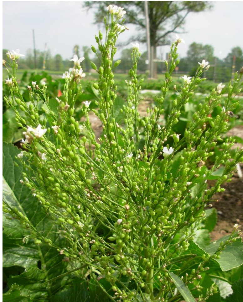
Figure 1. Horseradish inflorescence with maturing seed pods during mid-spring outdoors in a polycross field block.

probably occurs. The proven cross method (with specific directed crosses made by hand) has been used in more recent years to target specific genetic combinations. Comparisons of data obtained from the Illinois, USA breeding program for the two methods (polycross: 2007 to 2011, and proven cross: 2009 to 2017) indicate that the proven cross method is more efficient since less progeny are required to evaluate under field evaluations to produce new advanced clones compared to the polycross method (Table 1). However, both of these techniques will result in new, superior genotypes, and can be further repeated by inter-mating of advanced clones that were recently selected.