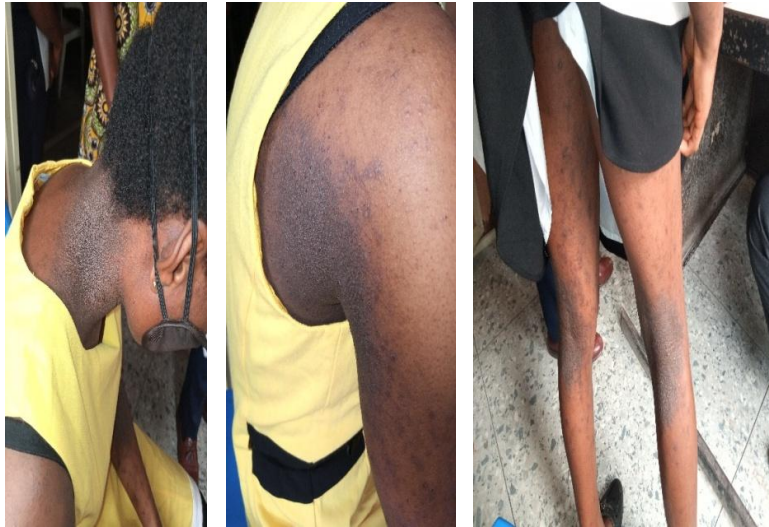
Fig. 6. Atopy dermatitis in a 15 year old female. Presented with a history of skin rash on flexural regions, itching and skin darkening