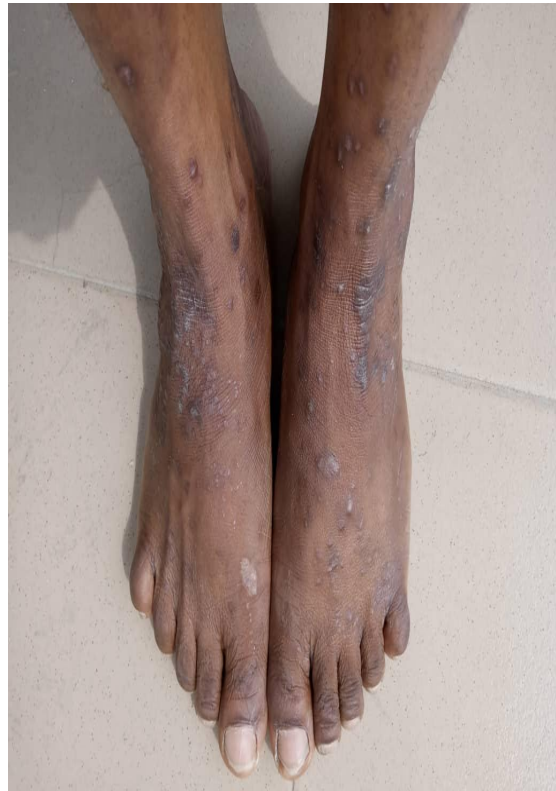
Fig. 4. A 34 year old male presenting with complaints of itching, papular skin rash, post inflammatory hyperpigmentation and scarring, a diagnosis of Lichen planus was made after a detailed history, examination and biopsy