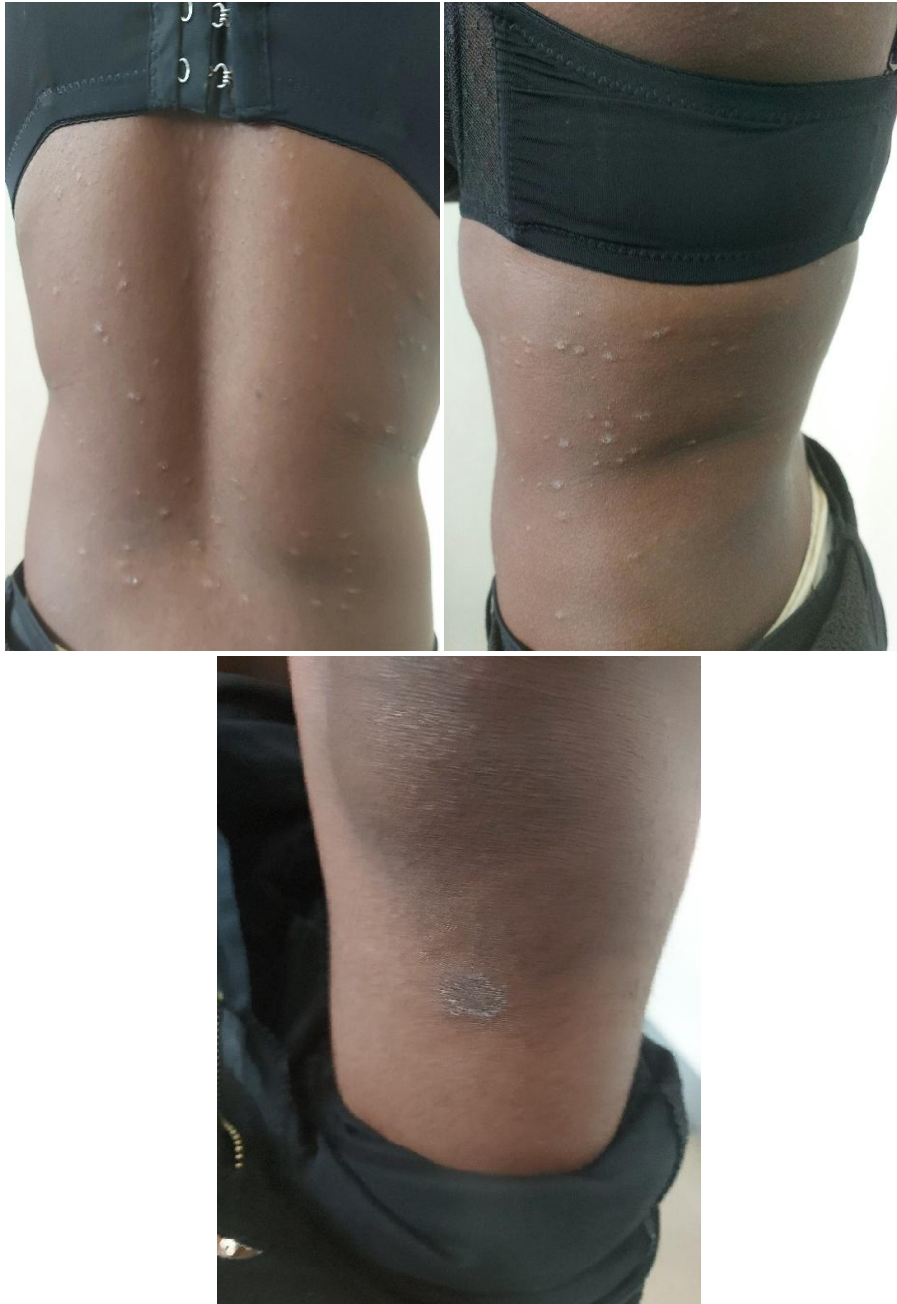
Fig. 5. Pityriasis rosea in a 23 year old female (skin lesions with herald patch)

Pruritus and urticaria (7.8%) was seen in 13 patients (7.8%). More common in adults, with Urticaria accounting for 7 (4.2%), Papular urticaria for 5 (3.0%), Aquagenic pruritus 1 (0.6%).