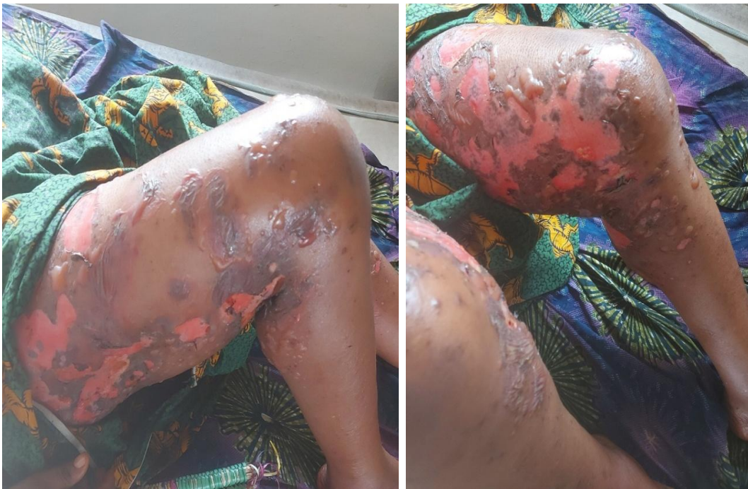
Fig. 10. Bullous pemphigoid in a 40 year old female