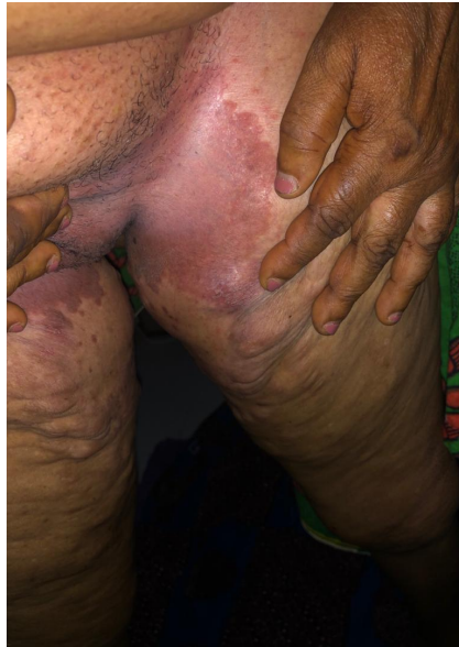
Fig. 1. Tinea cruris in a 43 year old female, presenting with complains of itching and change in colour of skin around the upper medial aspect of her thigh