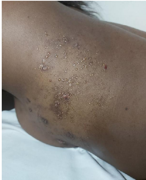
Fig. 11. Postherpetic neuralgia in a 19 year old female

The Federal Medical Centre Yenagoa is the only tertiary health institution with a dermatology out-patient clinic. Attending to patients from varying socio-economic background with a majority in the lower and middle class. Patients are attended in the dermatology out-patient clinic based on referral from either from the general out-patient department, other departments clinic as primary cases or based on referral from the general out-patient department or other departments in the hospital, as well as peripheral health care facilities with or without a referral letter mostly based on difficult to diagnose skin diseases. The number of patients attending the out-patient clinic has increased over the years for several reasons, including better awareness of the public, a state health insurance scheme which covers for 50% of the patient's health care expenses and a growing specialist clinic with more resident doctors.