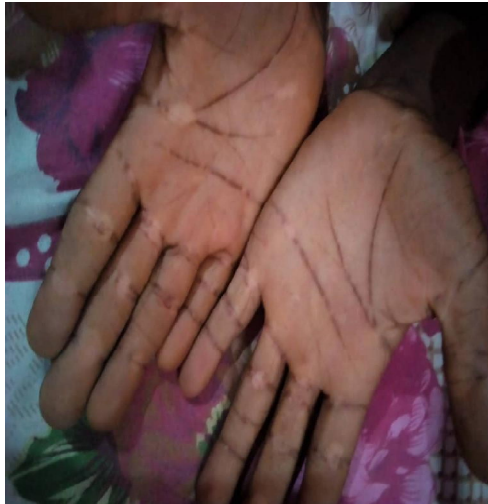
Fig. 9. A 7 year old male with perioral and acral vitiligo