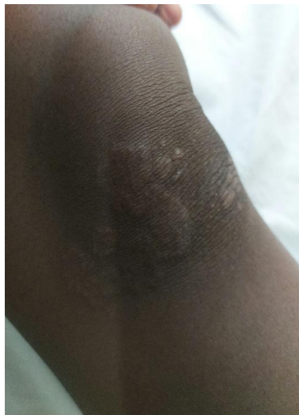
Fig. 2. Tinea corporis on the right knee of a 23 year old female

Papulosquamous disorders were seen in 34 (20.3%) patients, with lichen planus noted as the most commonly seen variety, accounting for 19 (11.4%) of cases. Lichen planus was also seen more in the adult group with a female preponderance. Psoriasis 3 (5.4%), pityriasis rosea 5 (3.0%), pityriasis nitidus 1 (0.6%).