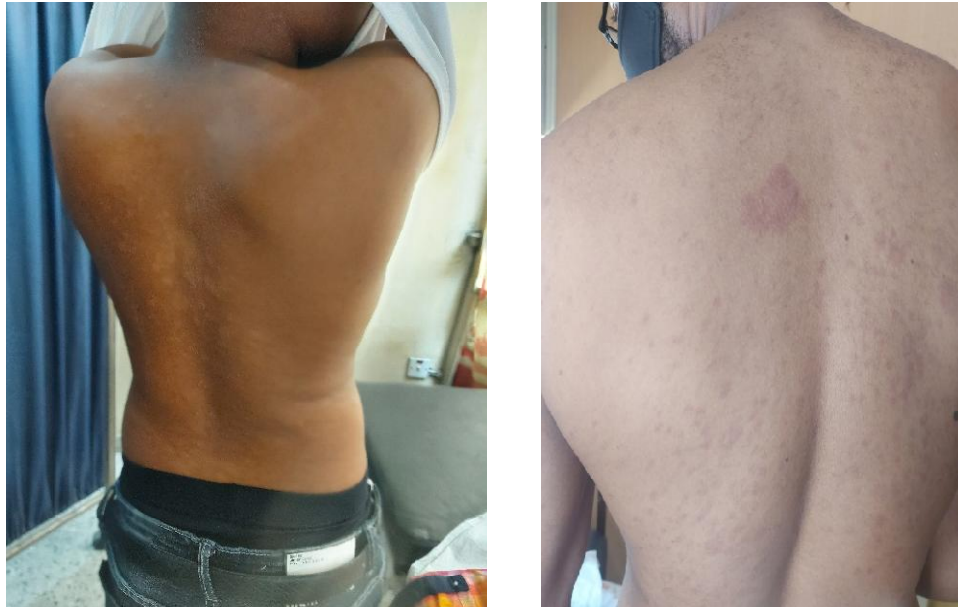
Fig. 3. Tinea vesicolor: To the left- a 12 year old male who presented with complaints of hypopigmented patches and to the right- a 27 year old male presented with Papulosquamous disorders