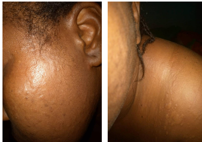
Fig. 7. A 35 year female with an evanescent rash being managed for Urticaria