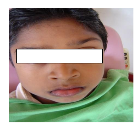
Fig. 1. Hemihypertrophy of the right side of face

"Overall, intelligence is usually normal, although BWS has previously been reported in association with mild to moderate mental deficiency due to hypoglycemic episodes or to subtle cytogenetic alterations" [17].