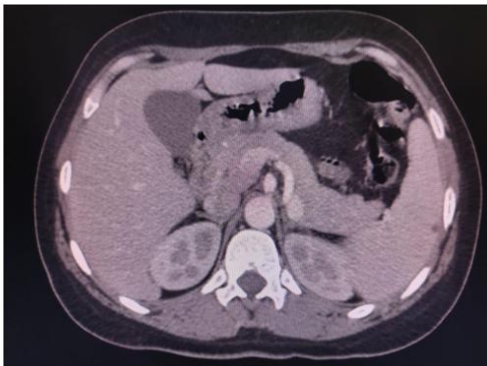
Fig. 4. Axial slice MRI showing a normal pancreas