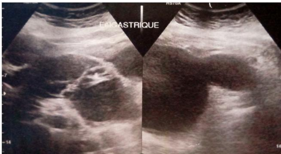
Fig. 1. Large cystic formations occupying all portions of the pancreas

6 months later, an abdominal CT scan was performed, showing a normal-looking pancreas.