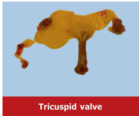
FIGURE 2: Photograph of the pathology specimen of the excised ruptured tricuspid valve.

of the myocardium, but can involve valvular structures, including the tricuspid valve [8].