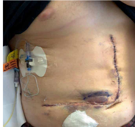
FIGURE 1: Patient with "J" incision and right-sided quadratus lumborum catheter. Left-sided catheter not shown in figure.

After closure of the right abdominal "J" incision and prior to emergence, ultrasound-guided QLC were placed bilaterally (Figure 1). A linear ultrasound transducer was placed in the anterior axillary line and moved posteriorly until the posterior aponeurosis of the transversus abdominis muscle became visible (Figure 2). In this lateral QL block (QL type 1), a 17-gauge Tuohy needle was utilized to thread a nerve catheter into the fascial plane. The Tuohy was inserted from the anterior end of the transducer and advanced until this aponeurosis was penetrated (Figure 3). Dissection with sterile saline confirmed the location, and after threading the catheter, 5 mL of 0.5% bupivacaine with 1 : 200,000 epinephrine was injected through the catheter between the aponeurosis and the transversalis