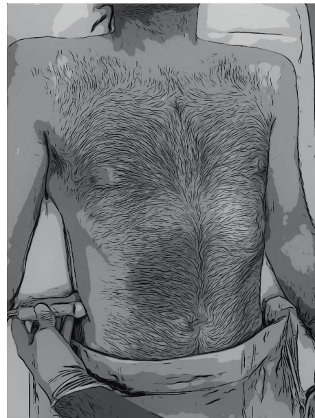
FIGURE 2: Placement of linear ultrasound transducer on the posterior aspect to allow visualization of posterior aponeurosis of the transversus abdominis muscle.