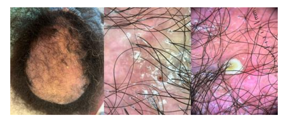
Fig. 3. Patch of cicatricial alopecia on the scalp with trichoscopy images

A metabolic analysis as well as investigation of associated pathologies with lichen were mad and were without abnormality.