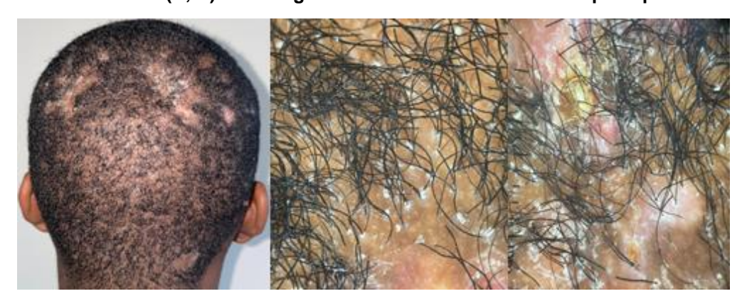
Fig. 5. Scarring patches of alopecia on the scalp with trichoscopy images