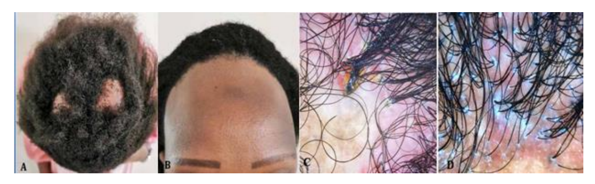
Fig. 1. 2 vertex cheloid patches of alopecia(A) with trichoscopy(C) linear frontal hairline recession(B) with trichoscopy(D)

A diagnosis of FD associated with frontal fibrosing alopecia (FFA) and lichen planus pigmentosus was confirmed by histopathology.