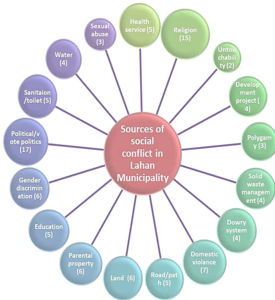
Fig. 1. The source of social conflict in Lahan municipalities