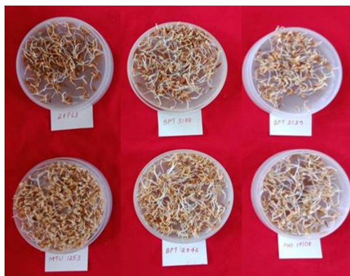
Plate 1. Seeds kept in petriplates for germination