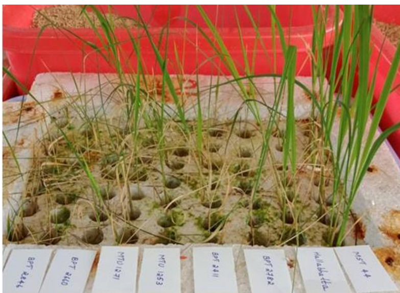
Plate 4. Scoring at 16 th day after salinization