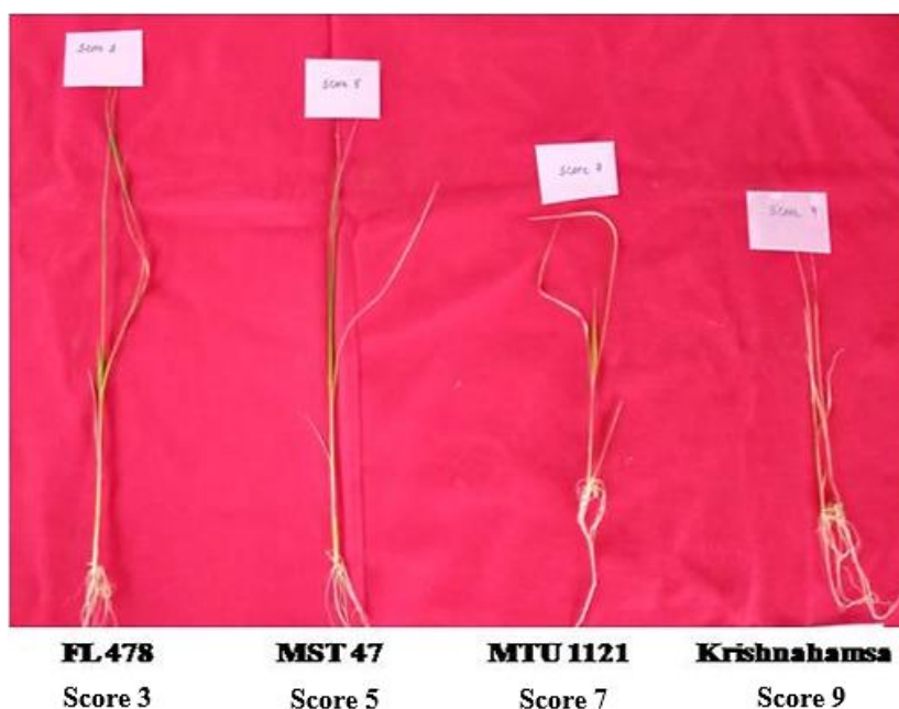
Plate 5. Scoring of rice germplasm at seedling stage as per SES, IRR