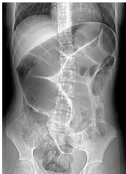
Fig. 1. Abdominal radiograph demonstrating distended bowel

increased bowel gas. Computer Tomograph (CT) of the Abdomen and Pelvis with oral and IV contrast (Figs. 1,2) was performed and demonstrated marked distension of the sigmoid colon with a swirled appearance of bowel mesentery concerning for volvulus. At that time, both pediatric gastroenterology and surgery were consulted. The patient was taken to the operating room for surgical intervention, undergoing sigmoid decompression (Fig. 3). Patient was then admitted to the pediatric service for monitoring.