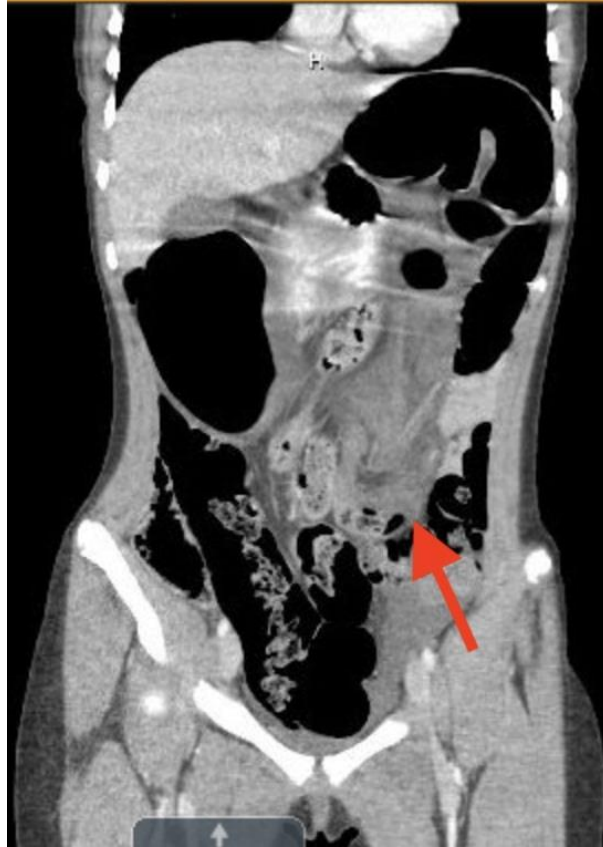
Fig. 2. CTAP coronal view; Whirl Sign

discharged on post-operative day (POD) 5 (hospital course day 7) with close follow up with Pediatric Gastroenterology and Surgery.