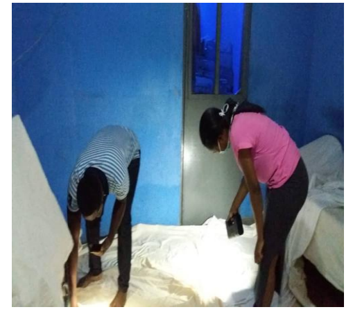
Fig. 1b. Collection of knockdown mosquitoes