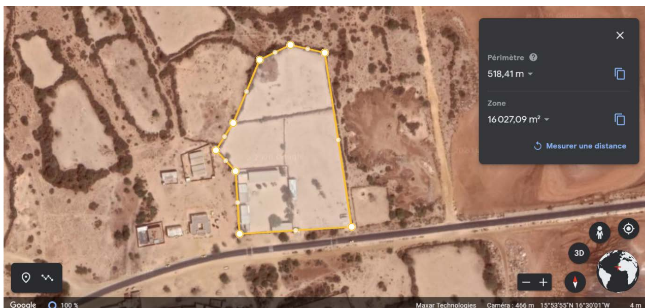
Figure 1. Location of the study site: Ndiebene Gandiol School.

latrines are operational. Moreover, the school lacks any water points, being devoid of taps. Its sanitation system is considered non-compliant. Finally, the condition of the toilets is concerning: they are in poor condition, frequently obstructed, and thus unusable for students and teachers most of the time.