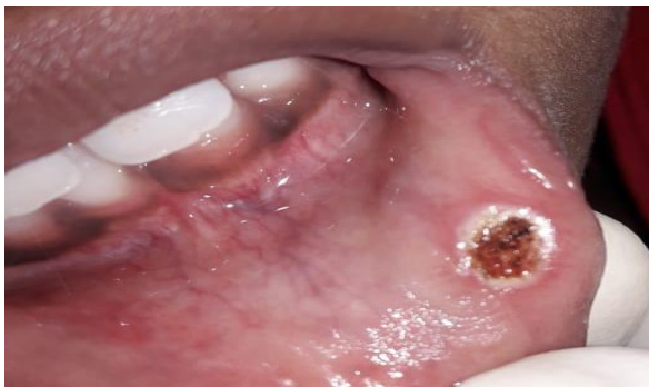
Fig. 2. Postoperative picture