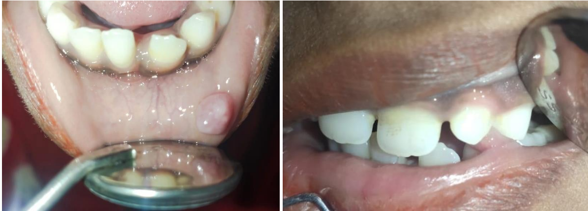
Fig. 1. Preoperative pictures

connective tissue suggestive of fibro epithelial hyperplasia (fibroma). [Fig. 4] Follow up done after 1 week. [Fig. 5].