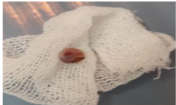
Fig. 3. Excised tissue