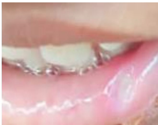
Fig. 5. 1 week follow up