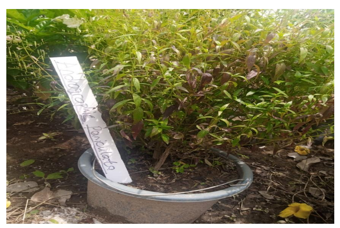
Fig. 1. Plant specie specimen in its habitat

Fresh leaves of A. paniculata were collected from the University premises, at the back of the animal house and identified by experts from both, the Department of Biology Sciences and that of the Department of Pharmacognosy, Bingham University. Nasarawa state. Voucher Plant species specimen were deposited at the Bingham University. herbarium. Bacterial isolates used in the study including, Escherichia coli, Staphylococcus aureus, and Salmonella typhi were obtained from National Veterinary Research Institute (NVRI), Vom.