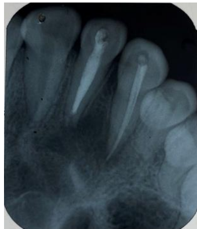
Fig. 3. 3 months follow up