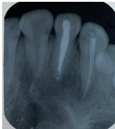
Fig. 6. 8 month follow up

At 14 days recall appointment, the intracanal medicament was replaced with metapex (Meta biomed Co. Ltd., South Korea) and the patient was recalled at 2, 3, 5, 6, and 8-month intervals. Metapex dressing was replaced on every subsequent visits i.e 2, 3, 5, 6, and 8 month. The patient was clinically asymptomatic and radiographic evaluation showed a reduction in the periapical lesion and disclosed significant apical development of the tooth at 3 months intervals. Her 6-month follow-up from this point revealed similar clinical findings and greater healing of the periapical lesion, but without apical closure. After 8 months, it was found radiologically that the apex was closed. Root canal treatment was then performed using gutta-percha cones (Dentsply) in two visits by conventional method.