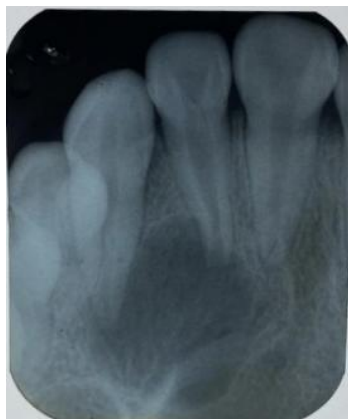
Fig. 1. Pre-operative

After local anesthesia, a rubber dam was applied and the access cavity was prepared. Working length was determined with a no. 15 k file and root canal preparation were done till no. 80 k file (DENTSPLY) using circumferential filing motion. The canal was then cleaned and irrigated with 2.5% sodium hypochlorite (Vishal Dentocare Pvt Ltd, Hyderabad) and saline. The canal was dried with the help of paper point, and triple antibiotic paste (metronidazole, minocycline, and ciprofloxacin in the ratio of 1:1:1) mixed with propylene glycol was placed as an intracanal medicament and the cavity was sealed with zinc oxide eugenol.