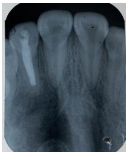
Fig. 4. 5 months follow up