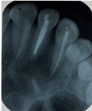
Fig. 2. 2 months follow up