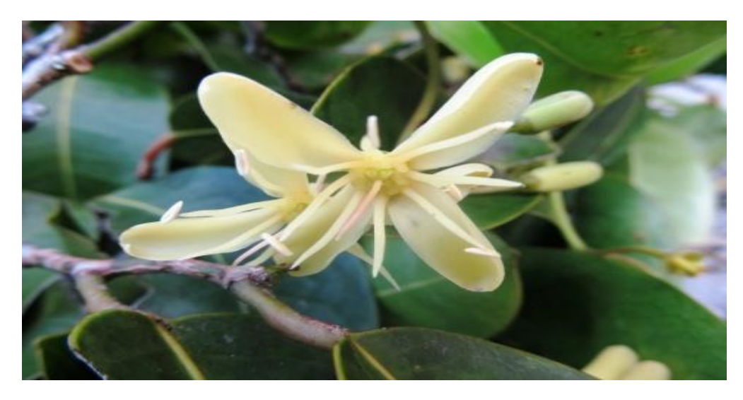
Fig. 1. Samadera indica plant