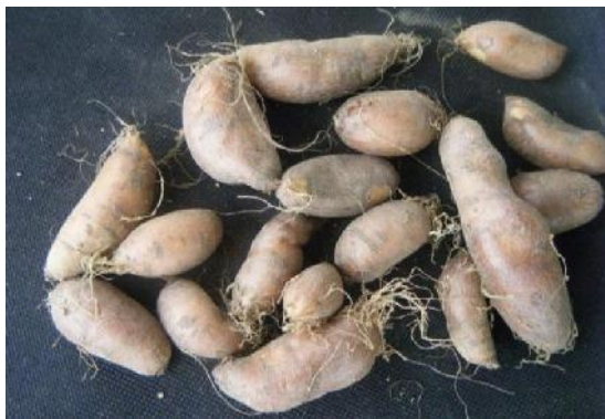
Fig. 2. Brown cultivar of frafra potatoes