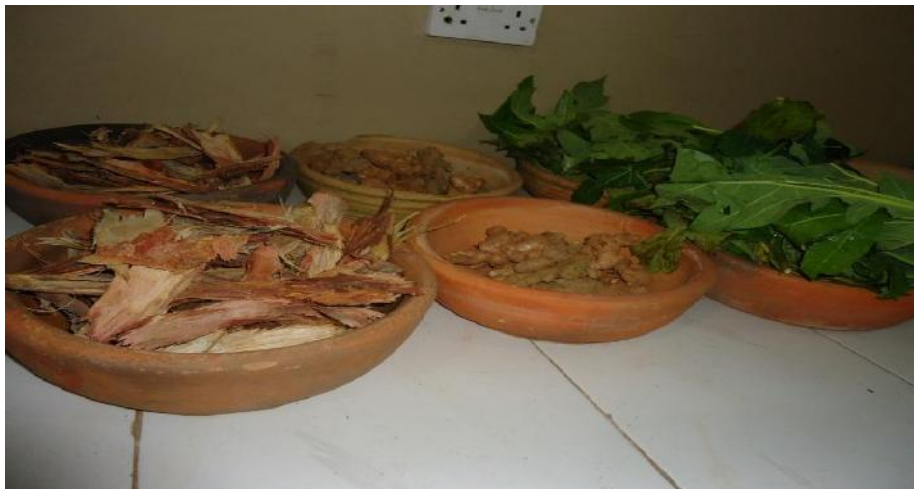
Fig. 1. Botanicals (Neem bark, ginger rhizome, and pawpaw leaves) used for the experiment

Black and brown cultivars of frafra potato tubers were used for the experiment. These tubers were all obtained from a single farm in Bongo-soe, in the Bongo district of the Upper East Region of Ghana. The farm was monitored from planting to harvest. The tubers were obtained on the day of harvest and transported on that same day to the location of the experiment. In all, eight hundred tubers were used for the study. This comprised of four hundred (400) black cultivar tubers and four hundred (400) brown cultivar tubers. The botanicals from which the extracts were prepared from were; matured pawpaw ( Carica papaya ) leaves, neem ( Azadirachta indica ) barks from a matured neem tree, and matured rhizomes of Ginger ( Zingiber officinale ).