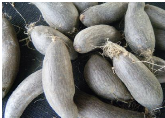
Fig. 3. Black cultivar of frafra potatoes