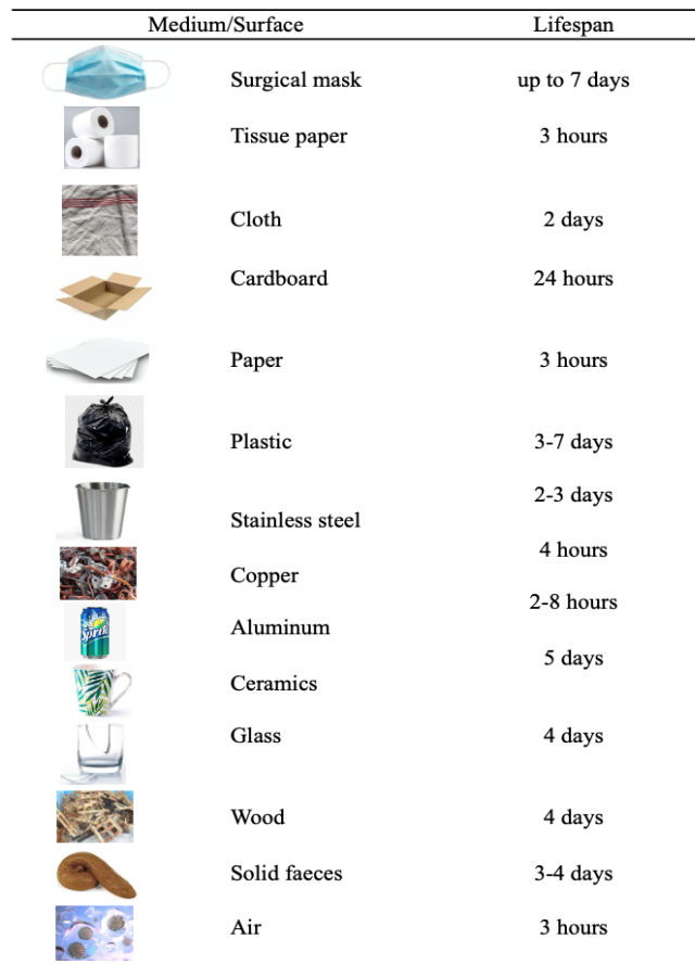
Fig. 1. The lifespan of SARS-CoV-2 on a different medium Sources: [10, 11, 12]