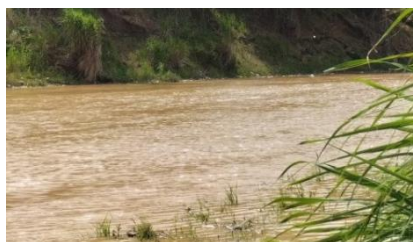
c. Station 3