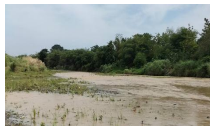
b. Station 2