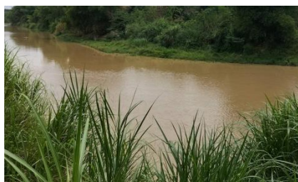
a. Station 1