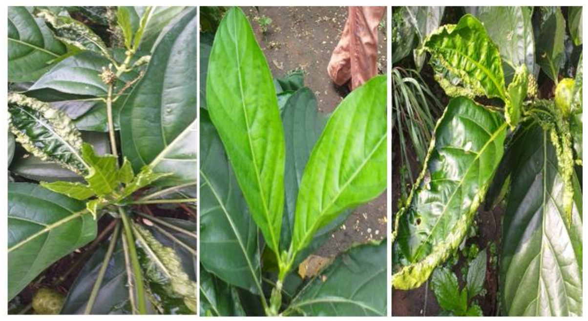
Plate 1. Foliar phytoplasma disease of Noni, sandwiched with the uninfected. Infected shoot are shorter with reduced leaves shrinking upward and inward