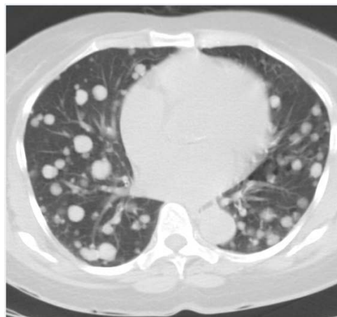
Figure 1. Computed tomography image of the thorax showing multiple “cannon ball” lesions of suspected lung metastasis

A chest computed tomography (CT) scan showed suspected bilateral pulmonary metastatic lesions (Figure 1). An abdominal ultrasound (USS) and (CT) scan revealed a huge intrahepatic mass in segments 4a, 4b and 5 with lobulated margins and heterogeneous enhancement post contrast (Figure 2).