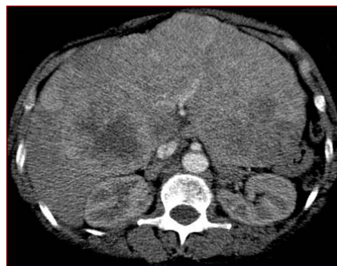
Figure 2. Computed tomography image of the abdomen showing a huge intra-hepatic mass in segments 4a, 4b and 5 with lobulated margins and heterogeneous enhancement post contrast

Normal \alpha fetoprotein level and colonoscopy results were followed by a USS-guided biopsy of the liver mass which histology were reported as