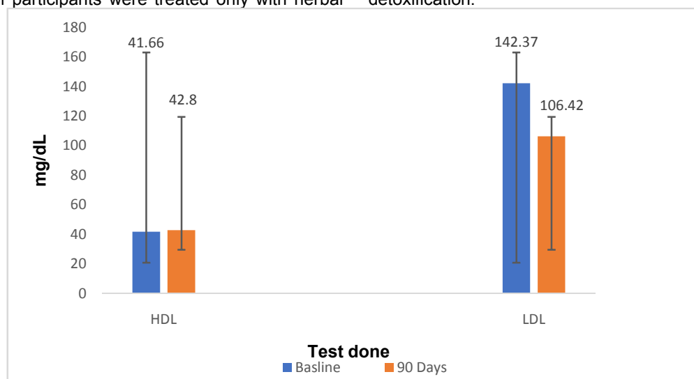
Fig. 2. Comparison of High density lipoprotein (HDL) and Low density lipoprotein (LDL) at baseline and after 90 days of treatment.

which participants were treated only with herbal detoxification.