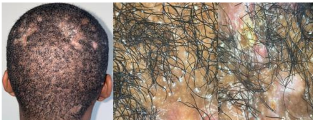
Fig. 5. Scarring patches of alopecia on the scalp with trichoscopy images