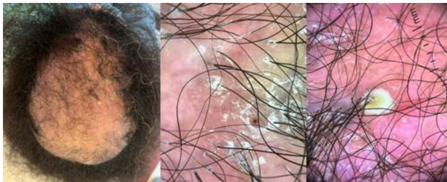
Fig. 3. Patch of cicatricial alopecia on the scalp with trichoscopy images

A metabolic analysis as well as investigation of associated pathologies with lichen were made and were without abnormality.