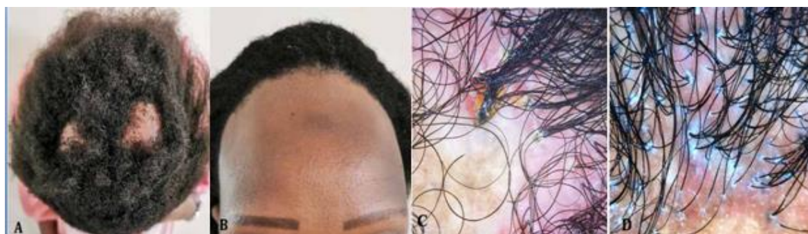
Fig. 1. 2 vertex keloid patches of alopecia(A) with trichoscopy(C) linear frontal hairline recession(B) with trichoscopy(D)

A diagnosis of FD associated with frontal fibrosing alopecia (FFA) and lichen planus pigmentosus was confirmed by histopathology.