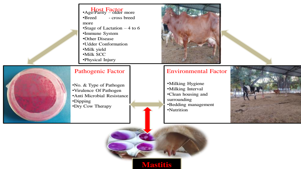
Fig. 1. Factors affecting udder health status and occurrence of mastitis

subclinical mastitis accounting for around 70% of this financial burden [51]. Additionally, subclinical mastitis results in substantial lactation losses ranging from INR 21,677 to 88,340 including reduced milk production, changes in milk quality and treatment cost [41]. Furthermore, mastitis stands as the primary driver of antibiotic usage in dairy farming, contributing to the emergence of antibiotic-resistant pathogens and posing significant public health risks [38]. Depending on their primary source of infection Addressing mastitis requires differentiation between contagious and environmental sources of infection within dairy herds [30]. While contagious bacteria spread mainly during milking procedures, environmental pathogens, including Streptococcus uberis , Escherichia coli , and Klebsiella spp , thrive in the cross breed cow's surroundings, particularly in bedding materials [29]. Given the significant role of bedding materials in transmitting environmental mastitis pathogens, proper housing and management practices are critical for minimizing exposure to these bacteria [56,29]. This underscores the importance of maintaining clean, well-drained dry cow areas and implementing routine cleaning protocols to mitigate the risk of mastitis transmission [22].