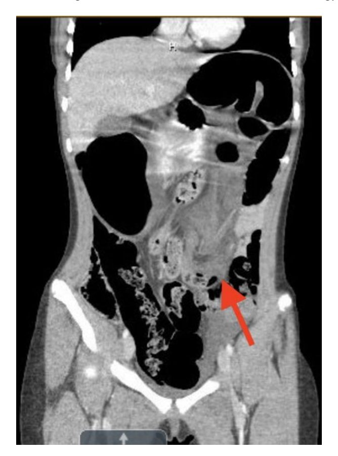
Fig. 2. CTAP coronal view; Whirl Sign

discharged on post-operative day (POD) 5 (hospital course day 7) with close follow up with Pediatric Gastroenterology and Surgery.