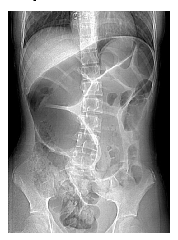
Fig. 1. Abdominal radiograph demonstrating distended bowel

increased bowel gas. Computer Tomograph (CT) of the Abdomen and Pelvis with oral and IV contrast (Figs. 1,2) was performed and demonstrated marked distension of the sigmoid colon with a swirled appearance of bowel mesentery concerning for volvulus. At that time, both pediatric gastroenterology and surgery were consulted. The patient was taken to the operating room for surgical intervention, undergoing sigmoid decompression (Fig. 3). Patient was then admitted to the pediatric service for monitoring.