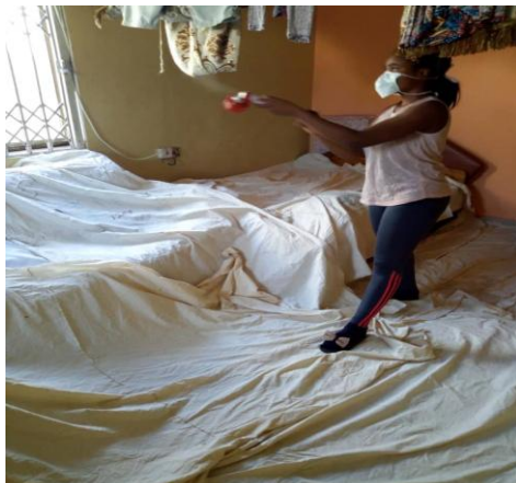
Fig. 1a. Spraying of a room with pyrethroids spray

A well-structured form was designed to aid in the collection of information regarding the use of insecticide-treated nets, insecticide spray, and mosquito coil, as well as other pertinent demographic information.