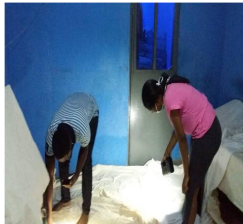
Fig. 1b. Collection of knockdown mosquitoes

The capillary blood obtained was from individuals who spanned the ages of 2 and 80 years. The general prevalence among the study population of 90 individuals was 1.1%.