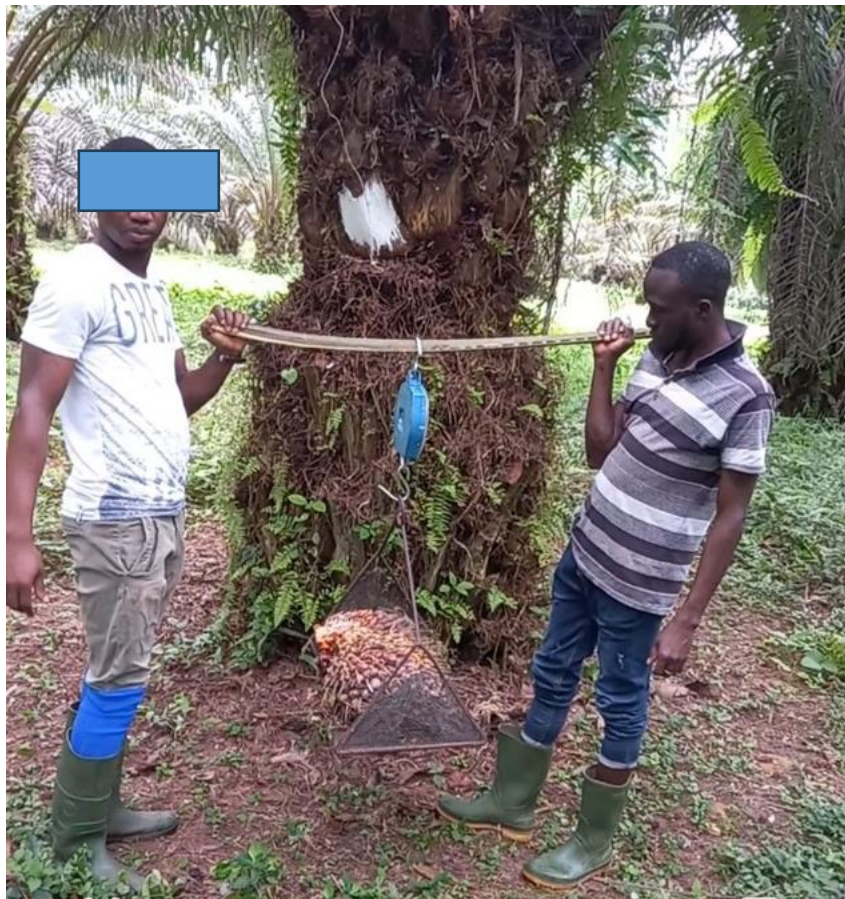
Fig. 1. Technique for weighing bunches per tree

The data relating to the components of bunch and palm oil yield collected on the controls and progenies were analysed using SAS version 9.4 and XLSTAT version 2019 software. An overall assessment of the variables measured was carried out using descriptive statistics parameters such as the mean, standard deviation, minimum and maximum. Next, an analysis of variance (ANOVA) with one factor (crosses) and two classification criteria (repetitions and blocks), incorporating the comparison of means according to Newman and Keuls at 5% risk, was applied to all