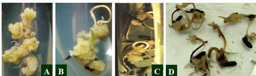
Fig. 2. A- Callus produced by Kalobhat on CIM MS + 2,4-D @ 1.0 mg/L; B- MS + 2,4-D @ 2 mg/L; C- MS + Yeast extract @ 200 mg/L; D- MS + maltose @ 6%