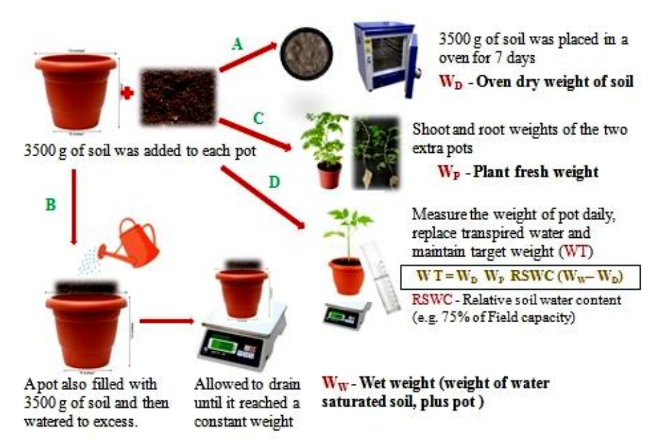
Fig. 1. Gravimetric method for creating drought stress

The experiment followed a factorial design within a completely randomized framework. It was replicated four times, and each calculated mean was based on four independent replicates. Statistical analysis was conducted using KAU-GRAPES online and mean comparisons were performed using a least significant difference (LSD) test with a significance level of P < 0.05.