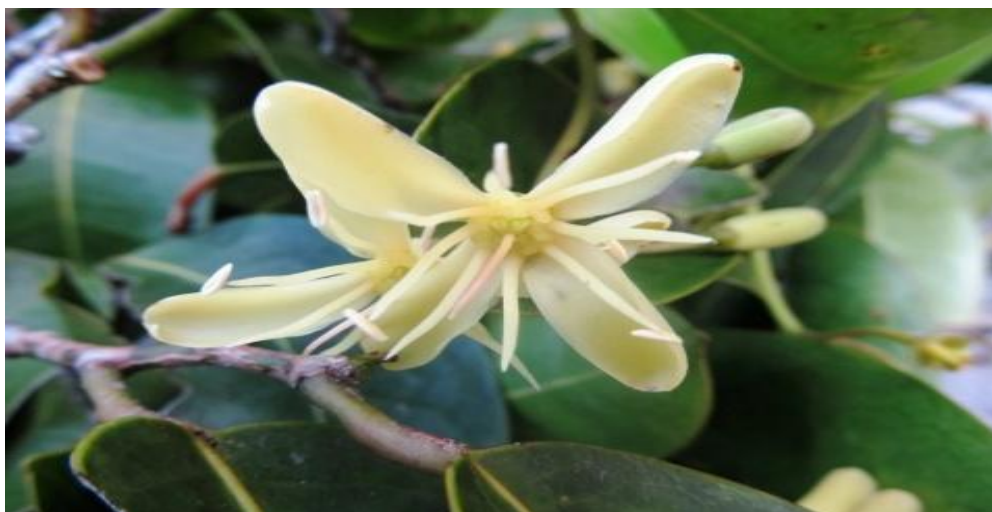
Fig. 1. Samadera indica plant