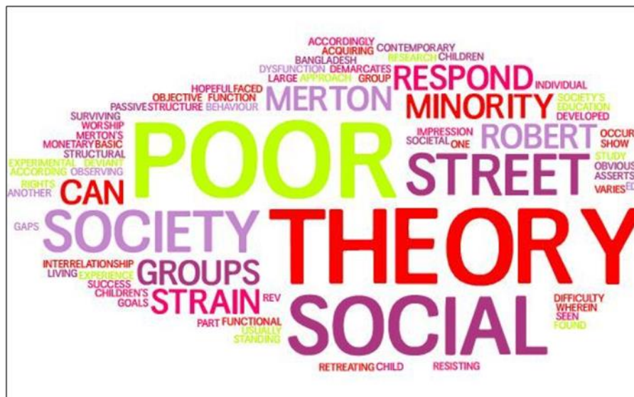
Figure 4. A Life of Stress among Street Children in Dhaka according to Robert K. Merton's Theory.