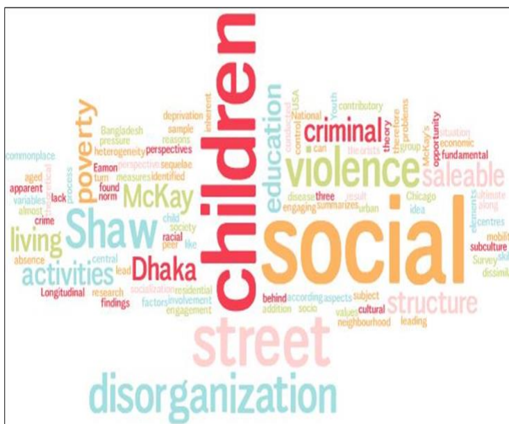
Figure 2. Social Disorganization among street children in Dhaka according to Shaw and McKay's Theory

Research conducted by Eamon M.K., with a sample group of children aged 10 to 12 (N = 963) from the National Longitudinal Survey of Youth (USA) found that neighbourhood problems and peer pressure, along with economic deprivation, are the leading contributory factors to social disorganization, which in turn can lead to child violence (2001). These factors are not dissimilar to those found in Bangladesh, where most street children living in Dhaka are victims of violence and are accustomed to a shortage of food and lack safe shelter, clean clothes, marketable skills, and medical facilities.