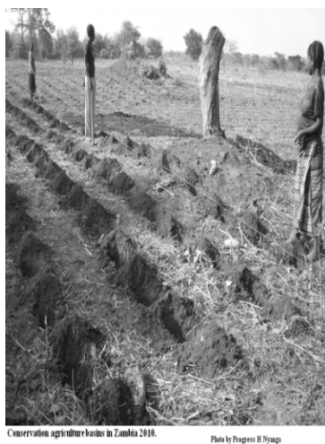
Figure 1. Conservation agriculture basins in Zambia in 2010

To the above definition of CA the Conservation Farming Unit (CFU) includes planting of Faidherbia albida for soil fertility improvement (CFU, 2011:78). There are two main variants of CA in Zambia: hand hoe based CA (Figure 1) and animal draft powered (ADP) CA (ripping) (Figure 2). A third variant, tractor based CA is not common (Figure 3).