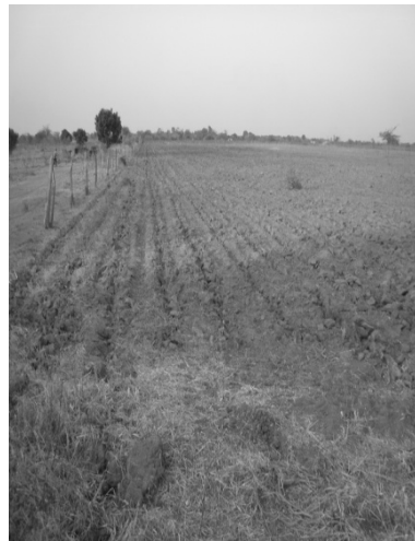
Figure 3. Tractor based CA in Zambia in 2010