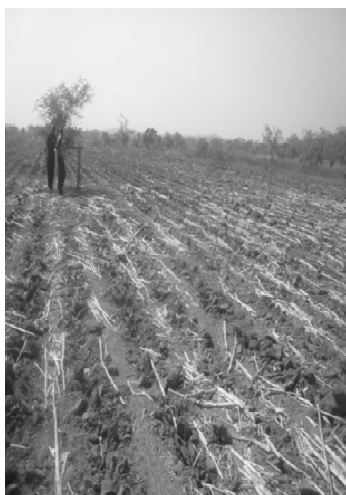
Figure 2. Animal draft powered CA (ripping) in Zambia in 2010