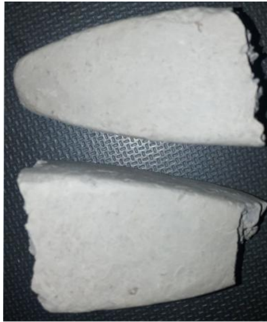
Fig. 1. A sample of kaolin from Enyigba, Abakaliki, Ebonyi State of Nigeria

8°10' E (Fig. 2) and falls within the lower Benue Sedimentary Formation of South Eastern Nigeria. The region is noted for lead/zinc mineral (Pb/Zn) mining activities.