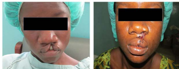
Figure 3. Before and after picture a twenty-five-year-old lady with an incomplete lip with Simonart band.

In our centre majority of patients with primary cleft lip and palate are below the age of one year and are referred soon after birth from other hospitals and maternity homes.