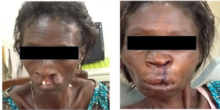
Figure 4. Before and after picture of fifty-five-year-old woman with complete cleft lip and alveolus.

This procedure has been used and still being used by many centres in Africa, other developing countries and missionary teams, and we agree with previous reports that this procedure is safe, effective and inexpensive [9]-[11]. We believe it might even be a better option in terms of cost for adult patients (if any) even in developed countries. We believe that this technique can be improved to be more comfortable and better tolerated by patients.