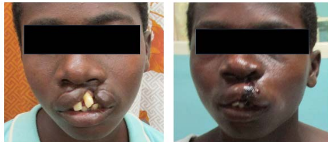
Figure 2. Before and after picture a thirteen-year-old boy with incomplete cleft lip and alveolus.