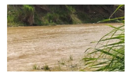
c. Station 3