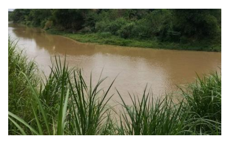
a. Station 1