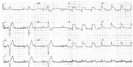
FIGURE 1: ECG showing ST elevation in the anterior leads while the patient was experiencing chest pain.