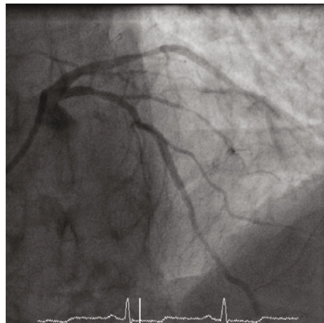
FIGURE 3: After administration of IV nitrates and resolution of the narrowing in the LAD.