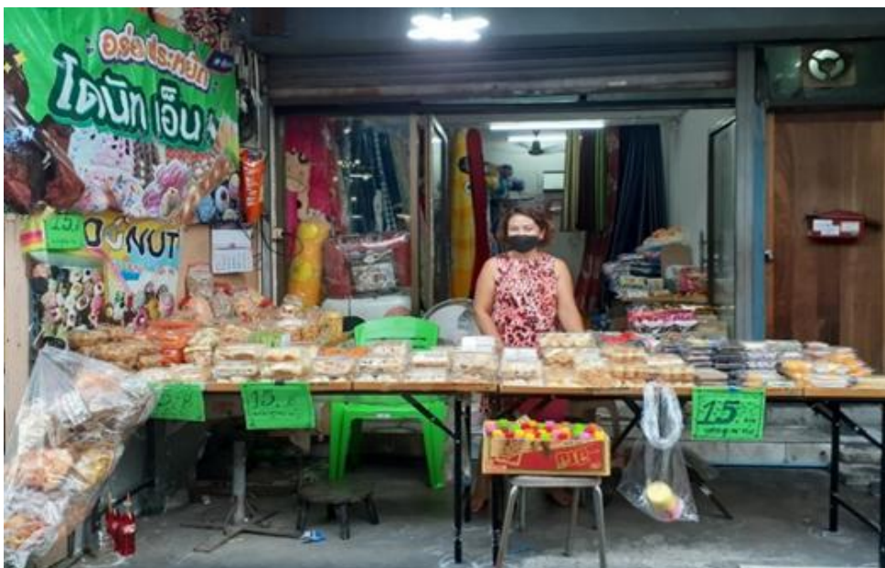
Fig. 2. Street Food Vendor selling packaged food during the Covid-19 pandemic

This study focused on the local phenomena of street food vendors in the capital city of Bangkok Thailand. However, as street food vending throughout Thailand is pretty much the same in terms of layout, organization, and operations it is hoped that generalizations can be made from this study. Street food vendors in other Asian countries and the world have many commonalities in terms of the entrepreneurial nature of these SMEs, operations, customers, and covid-19 coping mechanisms while the food items and tastes are localized.