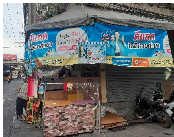
Fig. 1. Street Food Stalls in Bangkok during the Covid-19 pandemic