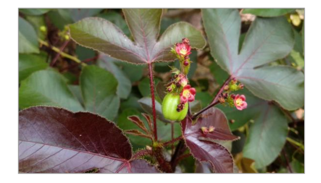
Fig. 1. Leaf, fruit and flowers of Jatropha gossypiifolia L.

The fruits are oblong capsules with 3 compartments that can be seen from the outside. Once reached maturity, the fruit explodes by projecting its seeds to more than 3 meters. They can thus grow not far (autochory), or be carried by the animals (zoochory). The species is very resistant because the seeds can remain viable in the ground for 10 years, and their germination can be encouraged by the fires.