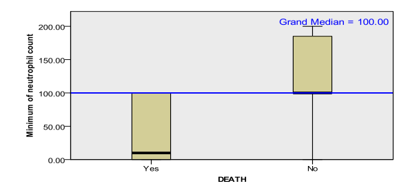
Fig. 1. Correlation between of neutrophil count and deaths