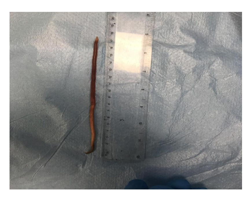
Fig. 3. Dead Ascaris worm